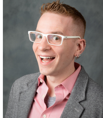
T.H.M Gellar Goad

* Type 3 metatheater is when characters acknowledge that they are in a play or TV show or movie. . This can come in the form of looking directly at the camera or audience and addressing the viewers —